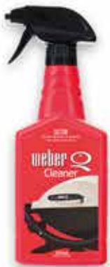
Weber Q Cleaner 500ml 219693