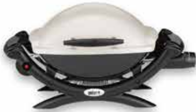
Weber Baby Q 1000 BBQ Titanium (also in black) 239457