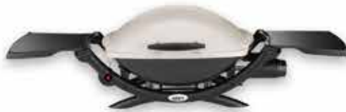
Weber Q2000 BBQ Titanium (also in black) 318399