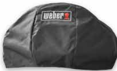
Weber Premium BBQ Covers Assorted SKUs