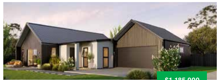
Wood Valley Wonderland!

House 181m 2 | Section 629m 2 | 3 | 2 | 1 | 1 | 2