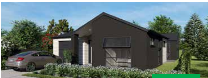
Tick The Boxes In Huapai

House 186m 2 | Section 18510m 2 | 3 | 2.5 | 2 | 2