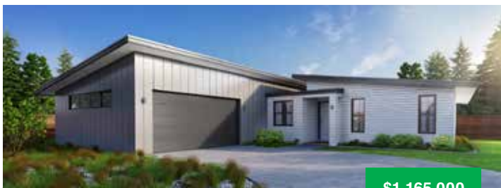
Country Living, Turn Key!