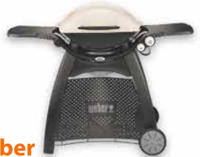
Weber Q 3100 LP BBQ Titanium (also in black) 239459