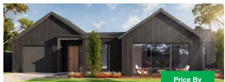
Architectural Kiwitahi Haven

House 144m 2 | Section 357m 2 | 3 | 2 | 1 | 1