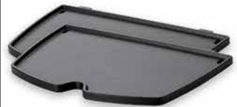
Weber Half Hot Plates Assorted SKUs

Mitre 10 MEGA Westgate & Henderson Northside Drive & Lincoln Road Monday to Friday: 7am - 7pm Weekends: 7am - 7pm